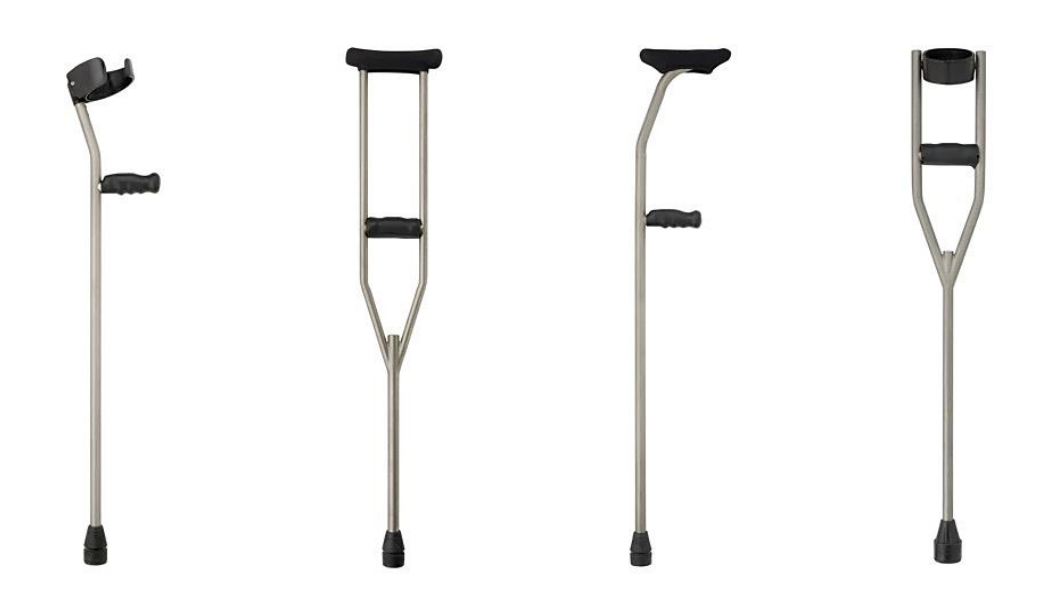
Figure 2 – The medical-hospital aesthetics in walking aids