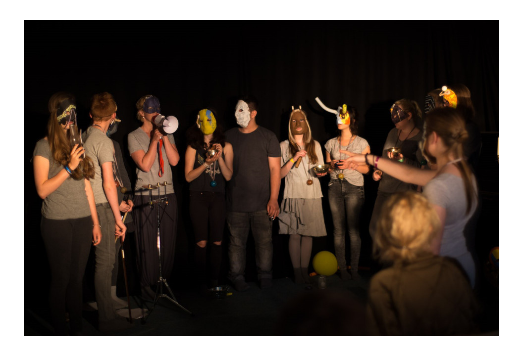
Figure 1: Performance in the hospital

the living environment of the young people. Each choreography was designed with the piano piece in mind. The movements were adapted to the level and the physical as well as psychological state of the respective patient.