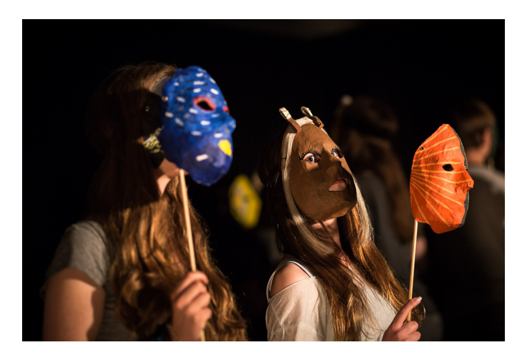
Figure 2: Excerpt from the choreography for the first movement of the Faschingsschwank aus Wien

The idea of having the patients create two masks was also based on the intention to make the individual change of the participants during the project visible. For the major part of the performance, the patience could choose freely and, above all, consciously which of the masks they would wear. They wore this mask during the entire performance attached with a ribbon to their head. The other mask was attached to a stick and held in their hands. However, the two masks were employed simultaneously only in one scene of the first movement of the Faschingsschwank.<sup>12</sup>