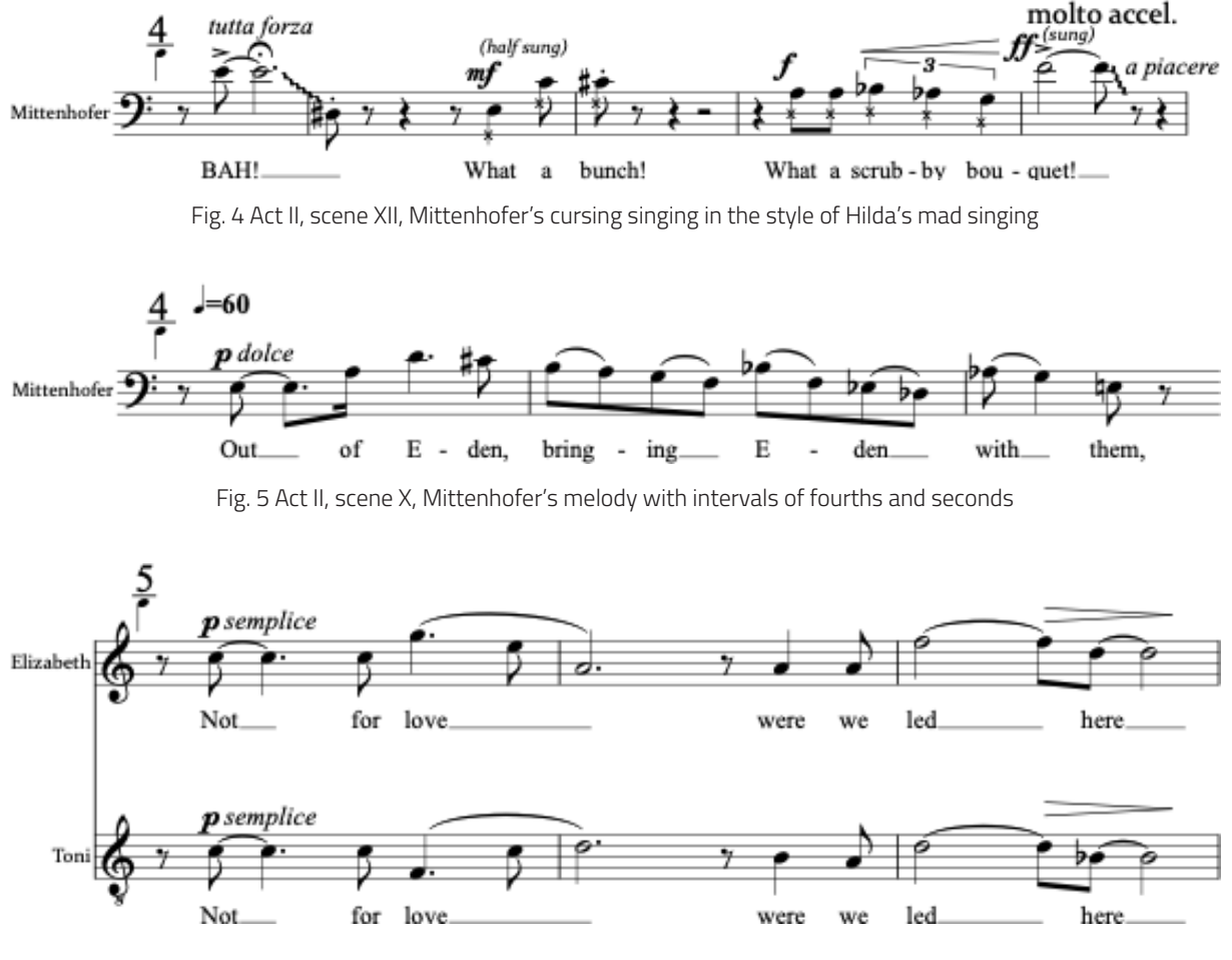
Fig. 6 Act III, scene VIII, the young lovers duet with triadic contours