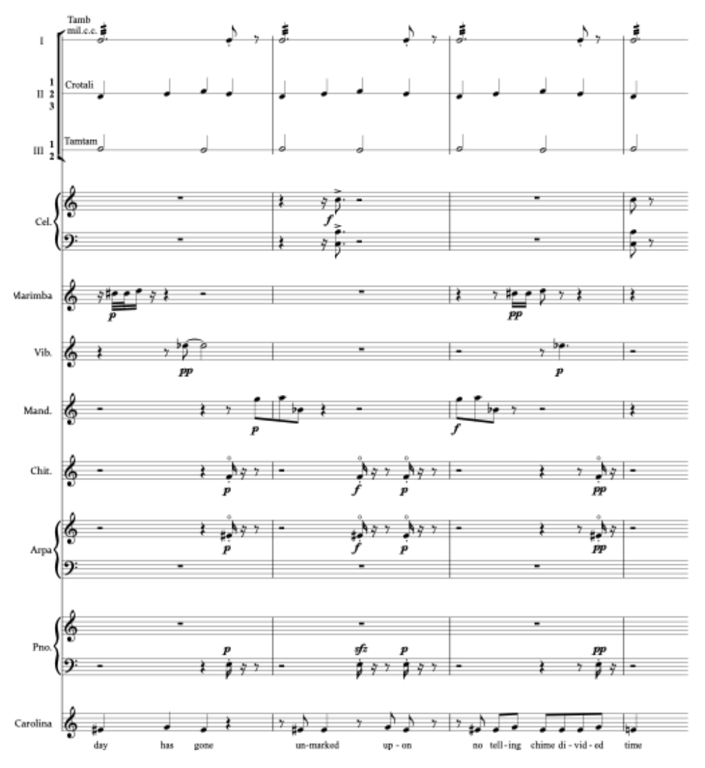
Fig. 1. Act III, scene VI, "mechanic" texture imitating a clock working

Whether regarded as a simple theatrical material or reminiscences of Schaeffer's musique concrète , realistic sounds appears as musical characters in the opera, contrasting with the nineteenth-century Italian opera influences. As explains Henze, the clock-chimes appear in the ending and beginning of scenes, dividing time periods and symbolizing the protagonist's obsession with time (HENZE, 1982, 253). The high point of this procedure appears in act III, scene VI, when Carolina realizes that she acted as an accomplice to murder. At this point, the psychological time stops and Carolina enters in an introspective world. The clock with its mechanical pulse, depicted by a texture made of the repetition of quiet and short notes, represents, so to speak, a theatrical means of expression of time, antagonized by the poetic idea of eternity, symbolized by the glacier, where young lovers "crystallize" their love.