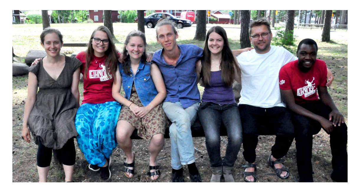
Fig. 11 – Participants of Ethno on tour 2018.

Even if JMI delayed its total embrace of the Ethno project, it is now one of JMI's main projects, acting as "JMI's global program for folk, world and traditional music" ( Jeunesses Musicales International ), organizing courses for anyone who wants to be an artistic leader in camps around the world, and selling this philosophy of music experience exchange.