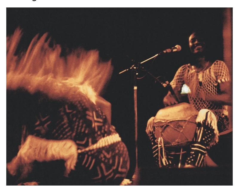
Fig. 3 - Farafina, from Burkina Faso at Falun Folkmusic Festival in 1990.

With the festival as a platform we, on my initiative, developed other activities related to folk or world music: Ethno ; a yearly market place and business meeting for Nordic folk/world music called Norrsken ; higher music education (university level); and Lira , a regular professional magazine for folk and world music<sup>10</sup>.