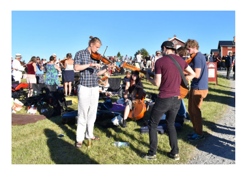
Fig. 9 – Musicians playing at Bingsjöstämman in 2018.