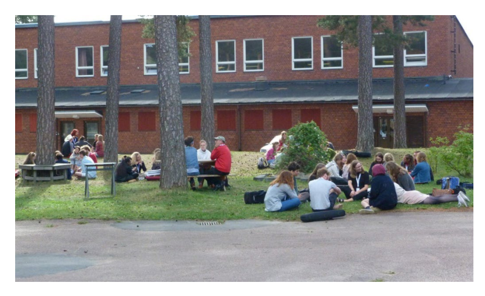
Fig. 7 – Moment of relaxation between small group and orchestra rehearsal during Ethno Sweden 2018. Behind is the gymnasium where orchestral rehearsal takes place