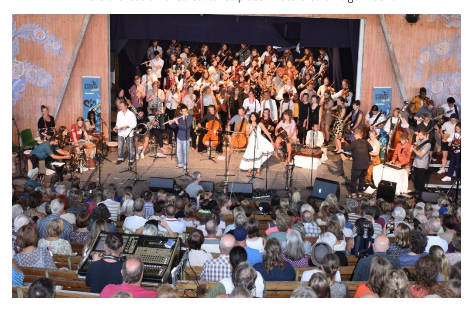
Fig. 8 – Final presentation of Ethno Sweden 2018 held at Rättviksparken July 5. The video footage of the whole performance is available at https://youtu.be/buBmXpyhBl4.