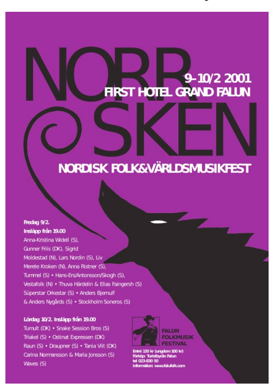
Fig. 4 – Poster from Norrsken meeting in 2001.

We launched two courses: Folkmusik i Norden (Folk music in the Nordic countries) and Folkmusik i Världen (Folk music around the globe). They were part of Högskolan i Falun/Borlänge (now Högskolan Dalarna) which is university level. They were for one year, organized as not full-time studies but 50%, meaning that after one year you got university points as if you had studied full time half a year.