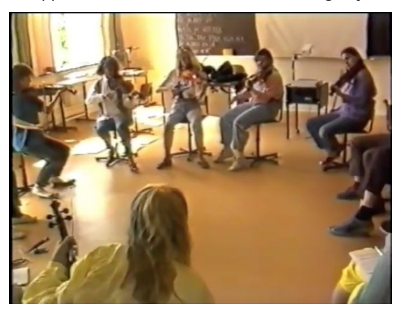
Fig. 5 – Still picture from the documentary about the 1990's Ethno available at https://youtu.be/UKhad4-4rbl. Here we can see students sitting in a circle, playing a tune taught by another student. This peer learning pedagogy and format is the same used in 2018's Ethno .

the genre, and also to widen the perspectives and references for all involved. One must remember that the general view, and especially regarding nonwestern cultures, was not something that was on the agenda in these organizations at that time. Rikskonserter/ JM Sweden and the folk music organizations were not in as funding partners but could provide production support and contacts and, moreover, "legality."