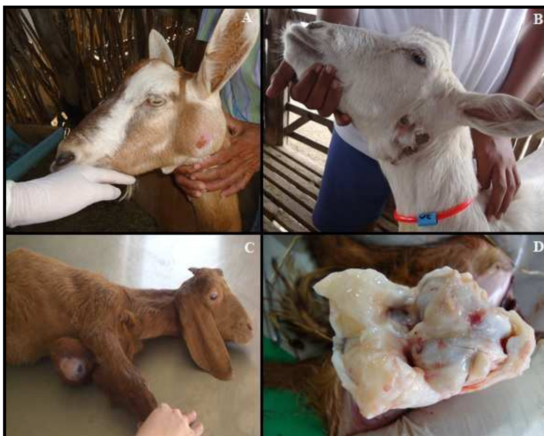
Figure 3. Goats evaluated in the state of Pernambuco. A) Abscess in the parotid region; B) Submandibular lymph node scar; C) Abscess in the xiphoid region; D) Fibrinolytic joint injury.

Among the sites with the greatest involvement by the abscesses, the superficial lymph nodes presented 72.4% (55/76) of frequency, with emphasis on the submandibular (Table 2). During the aspiration puncture of the abscess lesions, drainage of yellowish contents with a foul smell and purulent appearance was observed.