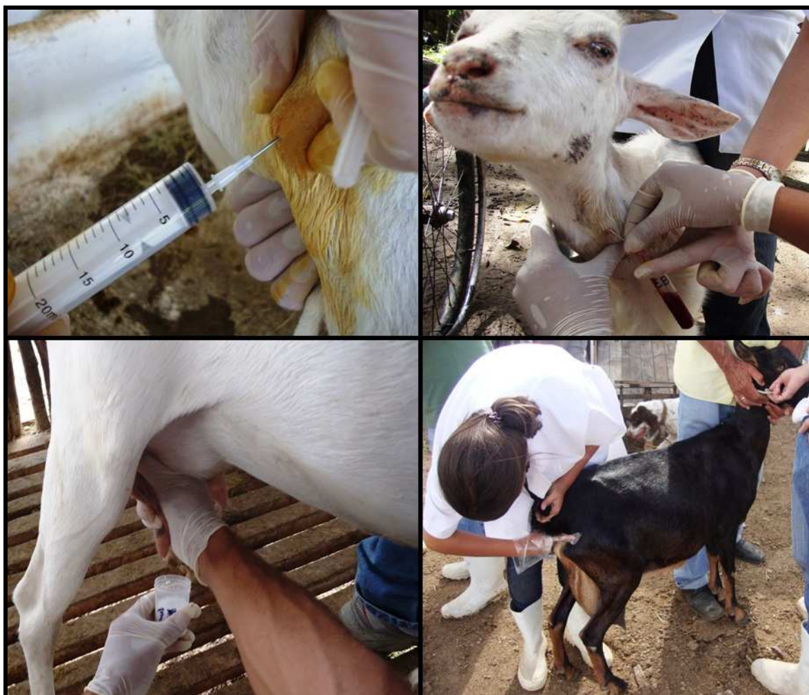
Figure 2. Collection of abscess content, blood, milk, and stool of goats in the state of Pernambuco.

Out of these, 25 symptomatic goats were selected for the collection of abscess content by fine-needle aspiration puncture, blood with anticoagulant (ethylenediaminetetraacetic acid - EDTA) by venipuncture of the external jugular, milk, and stool (Figure 2).